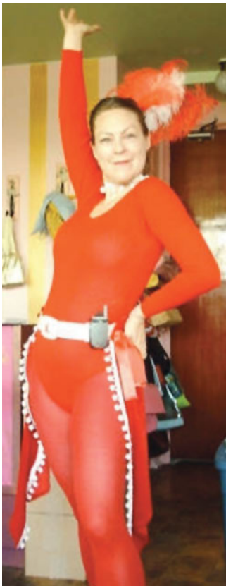
Here I am in the costume inspired by this year's AIDS Walk for Life on September 18, 2005